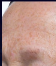
AFTER 2 WEEKS

*INDEPENDENT CLINICAL TRIALS **INDEPENDENT USER TRIALS